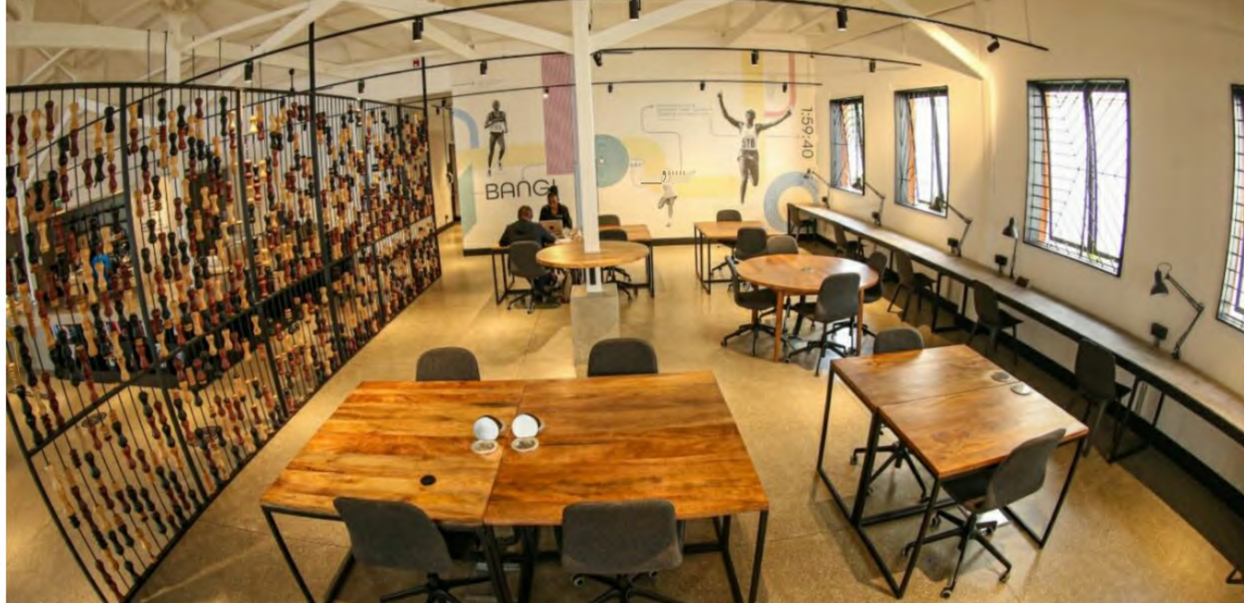
Some of the Kikao64 desks that can be booked for working either by walking in or via the website - Bizna Kenya