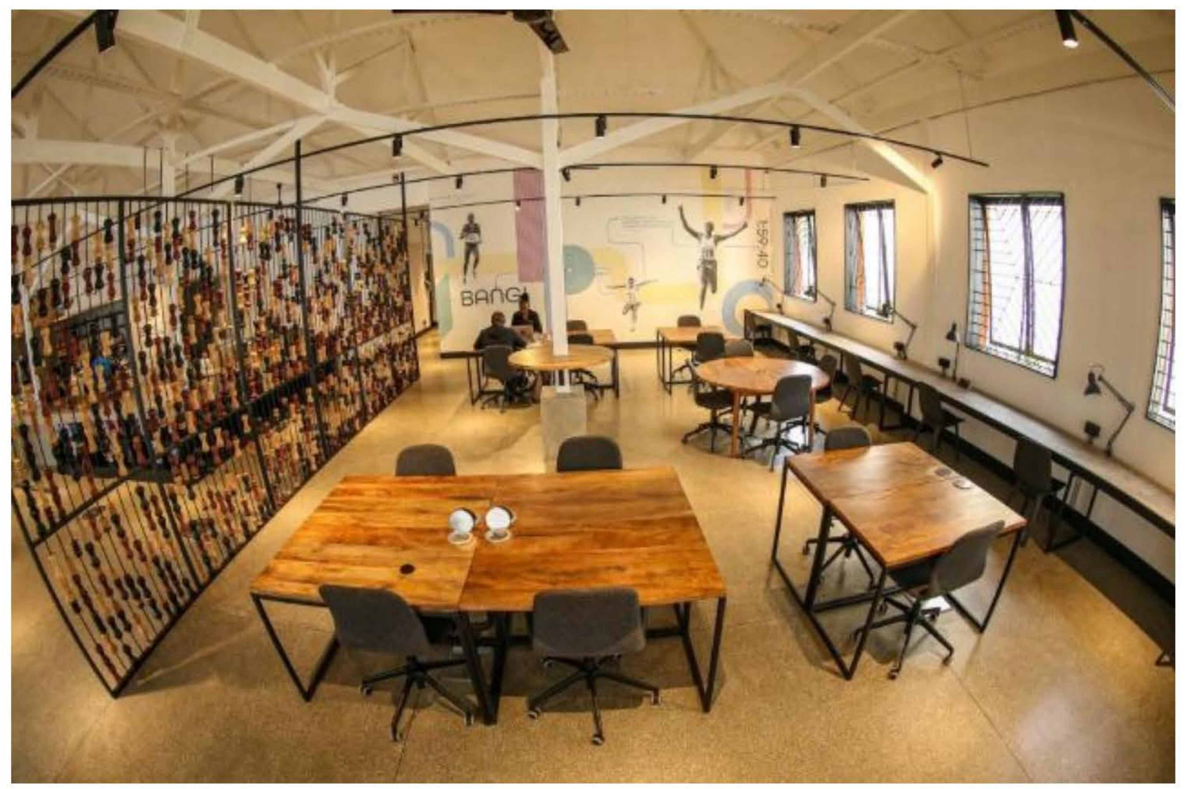
The modern co-working space will be known as "Inspiration Hub."

Inspired by the Swahili word 'kikao' (a place of coming together), Kikao64 was conceived as a modern gathering place where people can work, connect and thrive, in a space designed to provide a fully serviced, flexible and conducive environment to increase business opportunities and provide access and exposure needed for success, especially for young people in Eldoret facing barriers, while also supporting non-profit organisations, athletes and startups in need.